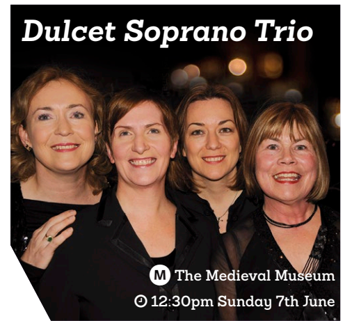
M The Medieval Museum ⓐ 12:30pm Sunday 7th June