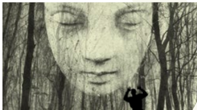
Ghost Story Festival Fri 31 Oct – Sun 2 Nov

Greyfriars Municipal Gallery Contact venue for details