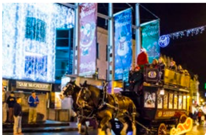
WINTERVAL – Christmas Festival Fri Nov 21st to Tue Dec 23rd